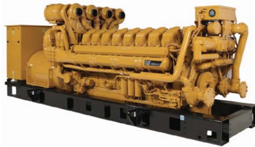
FIGURE 1: STANDBY GENERATOR

The paradigm of requiring 15 minutes or more of battery backup for mission critical UPS system reliability is an antiquated and flawed perception. When properly integrated and maintained, standby generators can and will reliably support the critical load in 10 seconds or less. This challenges the idea lead-acid batteries and extended backup time are necessary. The growing intolerance to a “graceful shutdown” also renders 15 minutes of backup moot. The UPS system can be designed with much higher reliability and predictability by using more reliable backup energy methods and applying proper design techniques. This paper discusses the issue and methods of implementing a short ride-through system with higher reliability and predictability than with traditional methods.