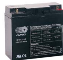
FIGURE 4: VALVE-REGULATED LEAD ACID (VRLA) BATTERY