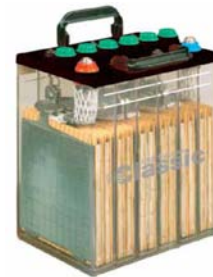
FIGURE 3: FLOODED BATTERY