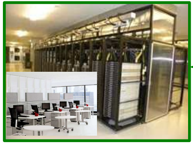
Datacenter, Ofis (omik) Yükler

What is Tier 4? It's the highest ranking available to data centers based on strict standards establish by the leading authority in hosting facilities, The Uptime Institute. CERTIFIED TIER 4